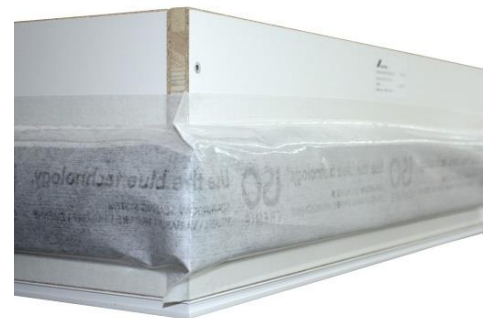
WDL insulation and sealing tape for an airtight connection between hatch box and ceiling