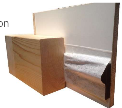
WDL insulation and sealing tape for an airtight connection between hatch box and ceiling