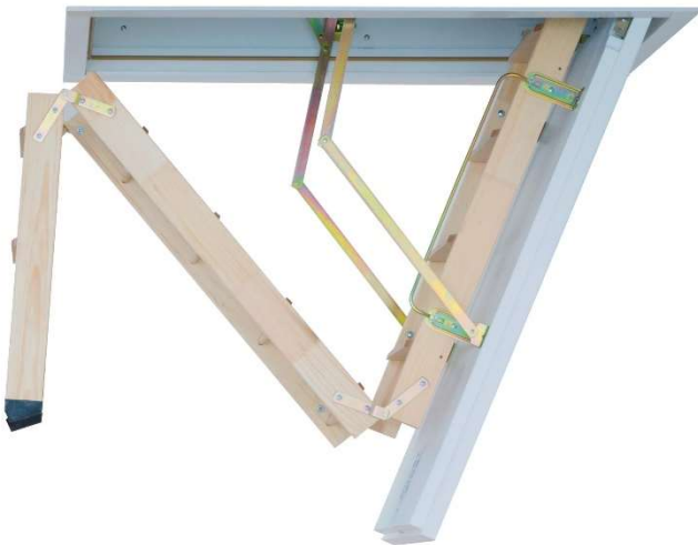
Cadet 3 wooden loft ladder combines traditional styling with high standards of thermal insulation