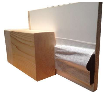
WDL insulation and sealing tape for an airtight connection between hatch box and ceiling