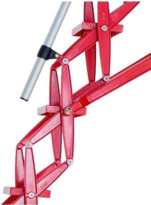
Supreme heavy duty aluminium loft ladder with optional red powder coat finish