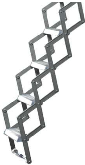
The Mini is manufactured from light-weight aluminium profile